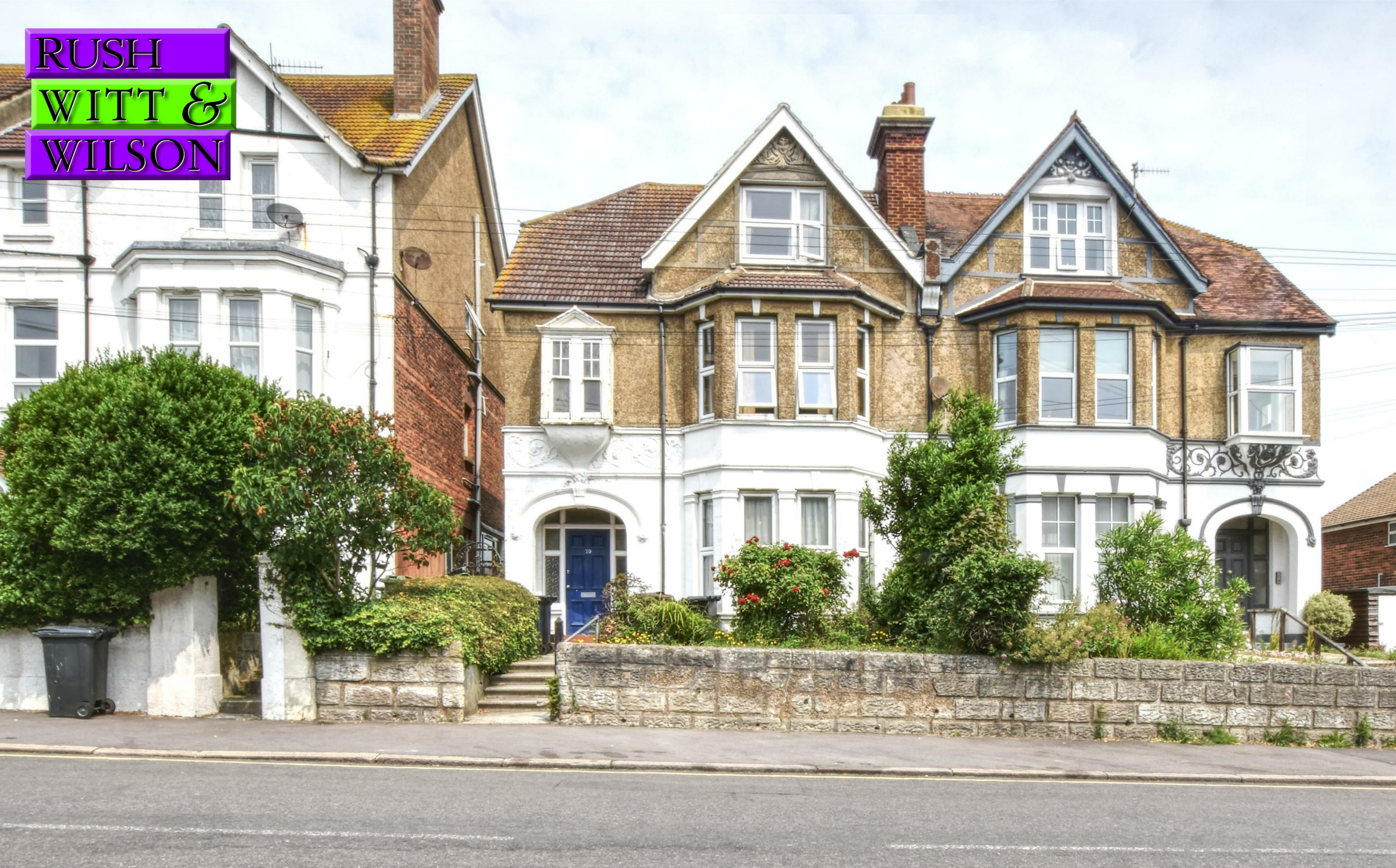
29 Magdalen Road, Bexhill-On-Sea, East Sussex TN40 1SD Guide Price £390,000